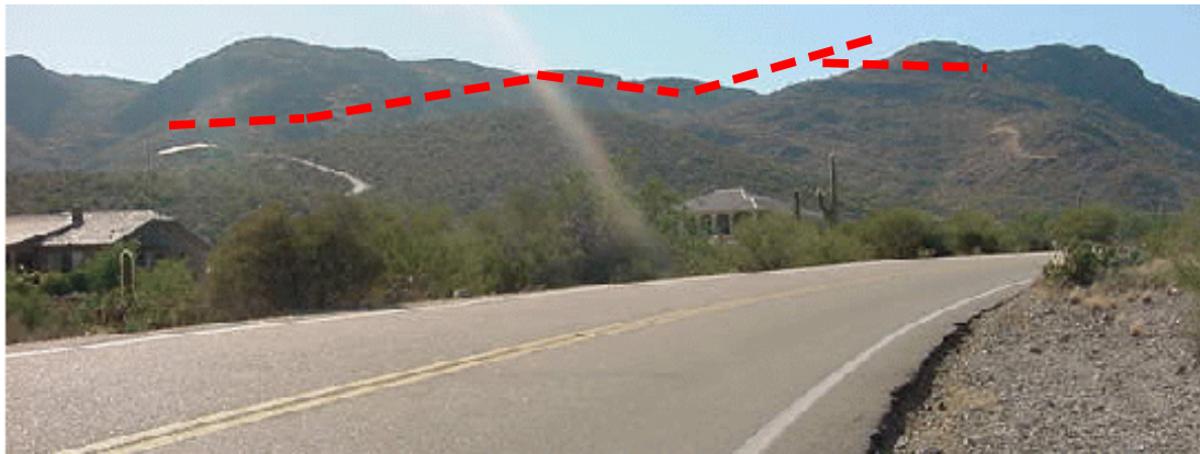
Photo facing southwest from gates Pass Road

Peaks & Ridges candidate no. 69 General Location Gates Pass Rd. west of Camino De Oeste Parcel Numbers 21211028B etc.