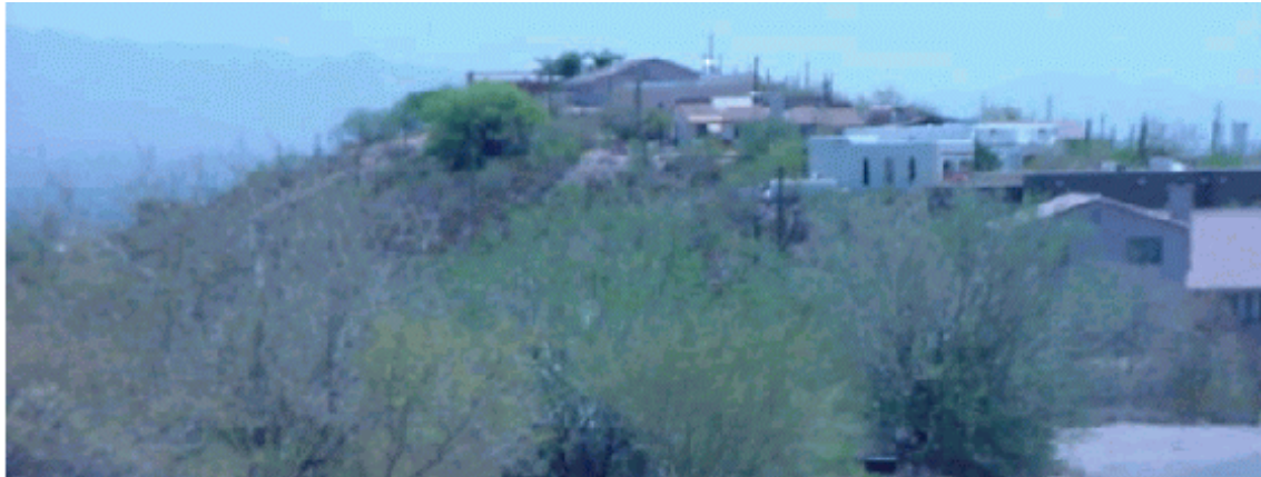
Photo facing east from Calle Del Suerte east of Camino De Oeste

Peaks & Ridges candidate no. 63 General Location Camino De Oeste & Ironwood Hill Dr. Parcel Numbers 116070340 etc.