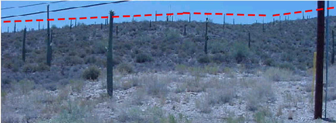
Photo facing south from Speedway Blvd.

Peaks & Ridges candidate no. 58 General Location Speedway Blvd. West of Painted Hills Road Parcel Numbers 116041640 & 116090060