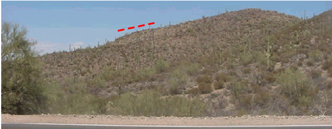
Photo facing northeast from Anklam Road

Peaks & Ridges candidate no. 57 General Location Anklam Rd. west of City of Tucson Limits Parcel Numbers 116090060