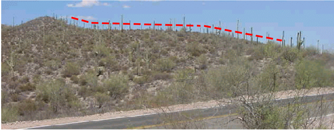
Photo facing north east from Anklam Road

Peaks & Ridges candidate no. 56 General Location Anklam Rd. west of City of Tucson Limits Parcel Numbers 116090060