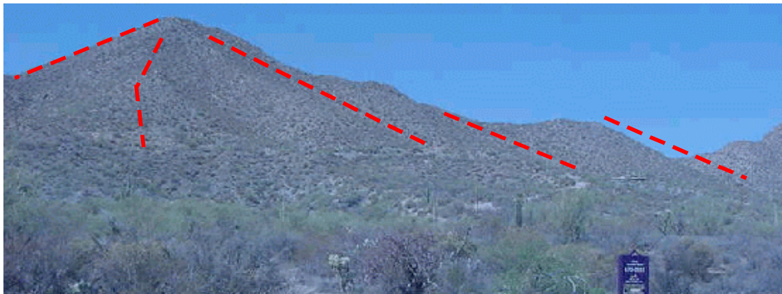
Photo facing south from Anklam Road

Parcel Numbers 11608009D, 11609008A & 11609008B