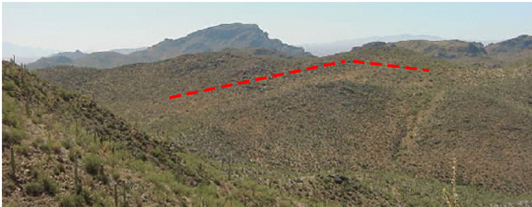
Photo facing southeast from Twin Peaks Protected Ridge Line